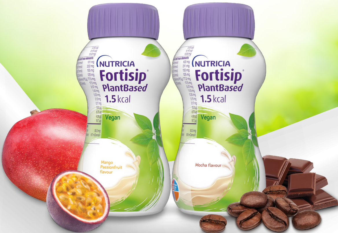
MANGO, PASSIONFRUIT AND MOCHA FLAVOURED DRINK