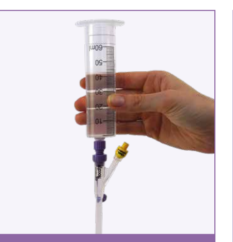
5. To slow the flow down, lower the syringe to sit level with or below the stomach.