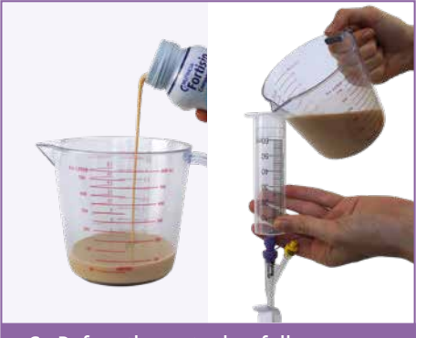
6. Before the water has fully run through (so as to not introduce air) do the same with the prescribed amount of formula over a period of 20 minutes. Repeat step 6 to complete the feed then close the clamp on the feeding tube.