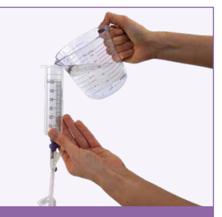
When the feed is finished add the water required, open the clamp on the feeding tube and flush the feeding tube with prescribed amount of water.